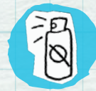
Insect repellent, if you are concerned about mosquito bites