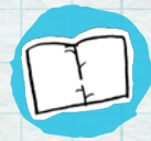
Paper or sketchbook (optional)