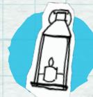
Light source (lamp or lantern)