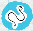
Extension cord, if light source is not battery operated