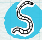
Rope (twice as long as your pillow case or towel)