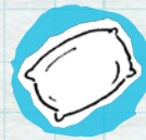
White pillow case or towel