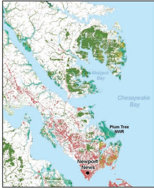
Year 2050 (11.2 inches)