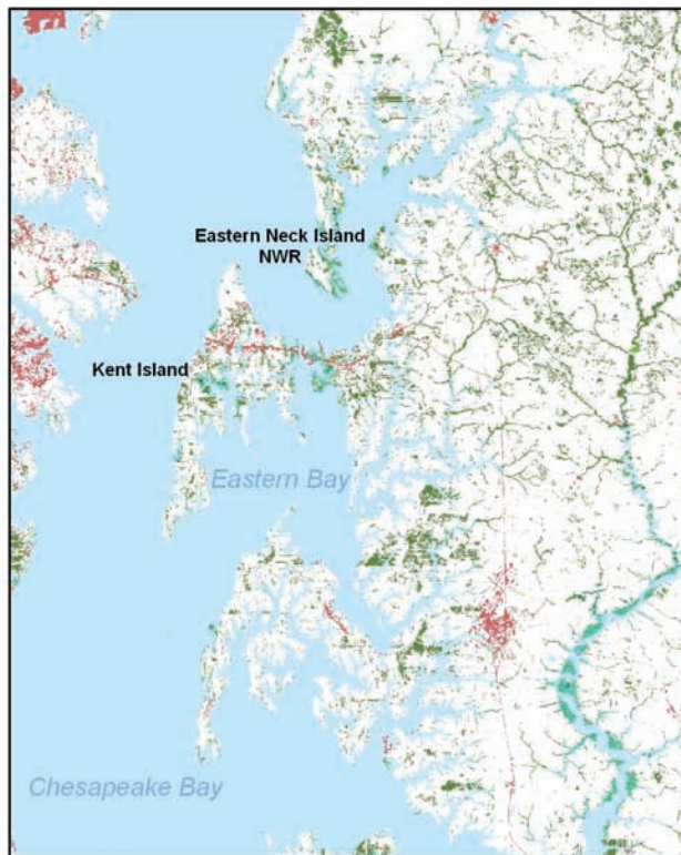
Year 2050 (11.2 inches)