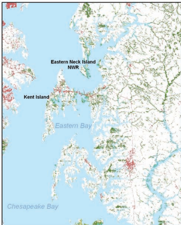
Year 2100 (27.2 inches)