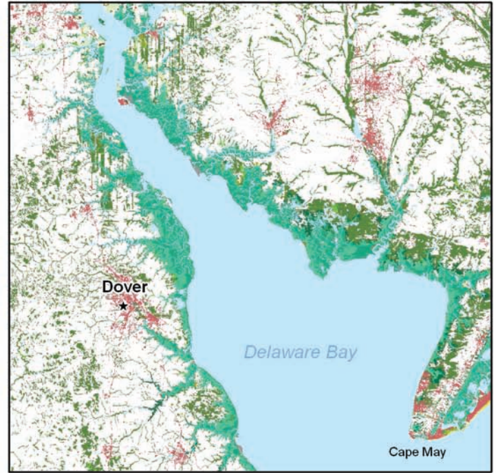
Year 2050 (11.2 inches)