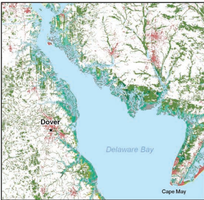
Year 2100 (27.2 inches)