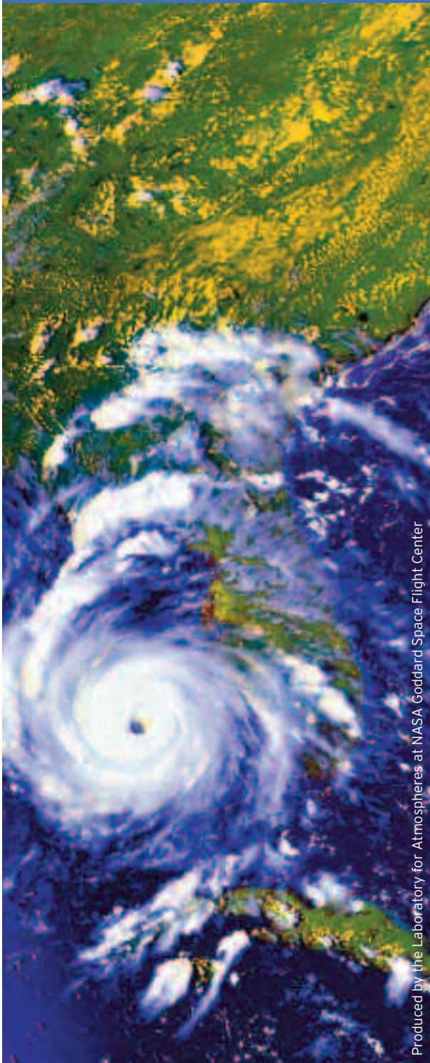
Produced by the Laboratory for Atmospheres at NASA's Goddard Space Flight Center

Stronger hurricanes, heavier rainfall, and rising sea level: this is what global warming has in store for the U.S. Gulf and Atlantic coasts. The latest science indicates that maximum hurricane wind speed will increase 2 to 13 percent and rainfall rates will increase 10 to 31 percent over this century. At the same time, sea-level rise will cause bigger storm surges and further erode the natural defenses provided by coastal wetlands that buffer storm impacts.