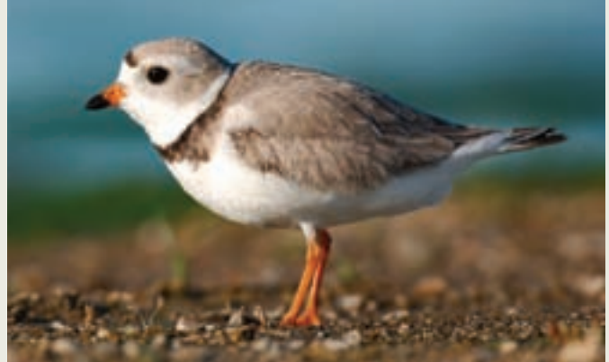
CRAIG BIRHLE, NDGFD

After nesting, Atlantic Coast plovers move south to spend eight to ten months—from July or even late June through March or April, with a few lingering into early May—along the coast from North Carolina through Florida and in parts of the Caribbean, joined there by piping plovers from all populations (North Carolina holds a unique position as the only state where the breeding and wintering ranges overlap and where the birds are present year-round.). The extensive use the plovers make of the Southeast Atlantic Coast indicates the region's importance to the species' survival.