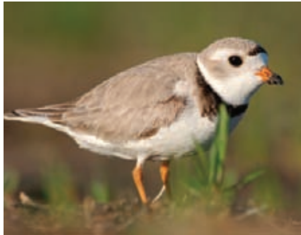
CRAIG BIHRLE, NDGFD

Funding from all government sources for piping plover recovery outside the Great Lakes area ranks the species at 58 out of 1,311 species, according to the U.S. Fish and Wildlife Service fiscal year 2004 report (the most recent available) to Congress, Federal and State Endangered and Threatened Species Expenditures . Total recovery funding for piping plovers outside the Great Lakes area, from all state and federal sources that year, was about $3.5 million, with $496,000 coming from the